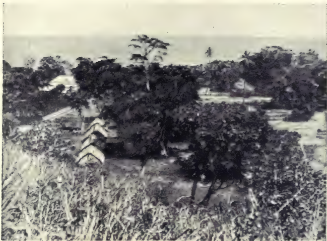
LENAKEL FROM THE HILL